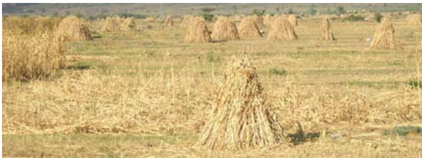
Figure 5. Conservation of sorghum stover in the field ( Kusa ).

The respondents also indicated that they practice feed conservation for dry season feeding. Feed is conserved in the form of what is locally known as Kusa (Figure 5), which is made by storing crop residue on the farm field (from sorghum only) in triangular form in an open system without any cover. This type of feeding is practised from crop-harvesting to end of the dry season. This storage system exposes the feed to moisture causing wastage through fermentation and insect pests. Due to the poor storage system, farmers often fail to get adequate conserved feed to take them up to the end of the dry season.