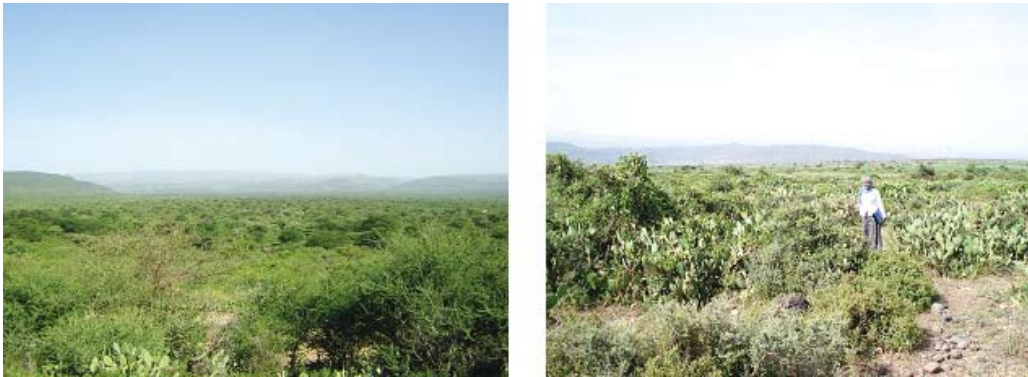
Figure 2. Pastoral (left) and agro-pastoral (right) production system in Mieso district.