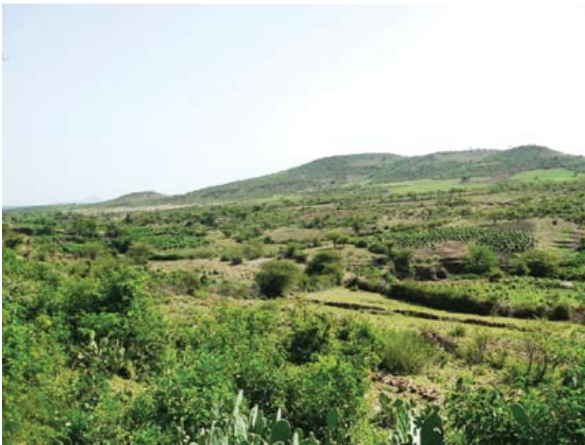
Figure 3. Crop–livestock production system in Mieso district.