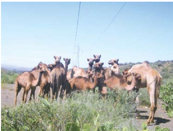
Figure 4. Cattle, goats and camels are important dairy animals in Mieso district.