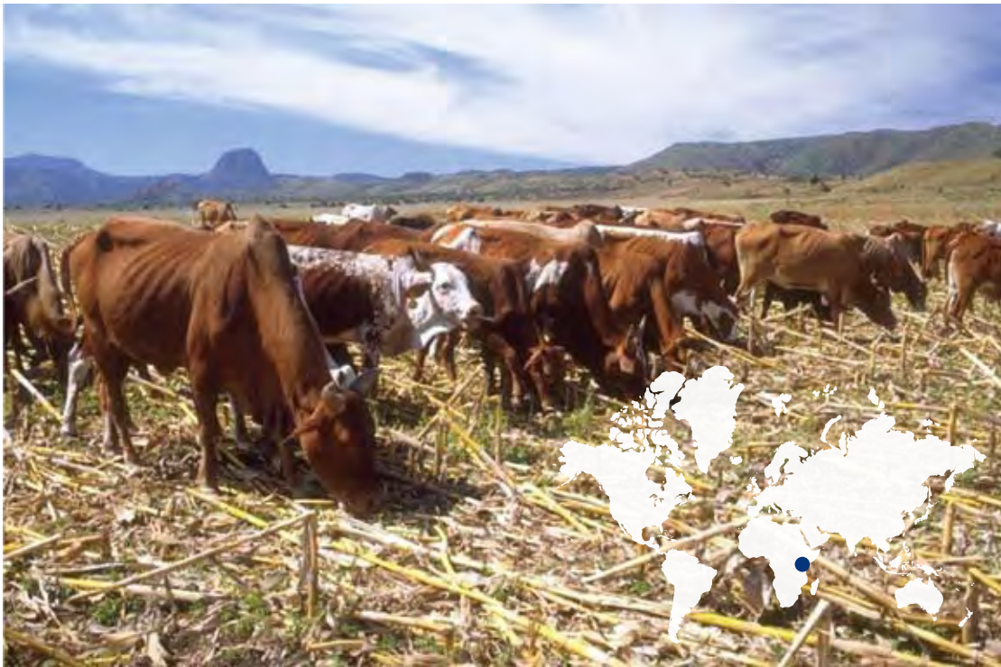
Photo 1: Cattle grazing maize straw in the Ethiopian Highlands. Crops often serve multiple purposes in the agricultural systems of Africa, and maize straw is a key dry-season feed resource for livestock in many places. The impacts of climate change may thus be felt in several different ways in such systems, in addition to its effects on food availability for the farmer's family and cash income for the household.